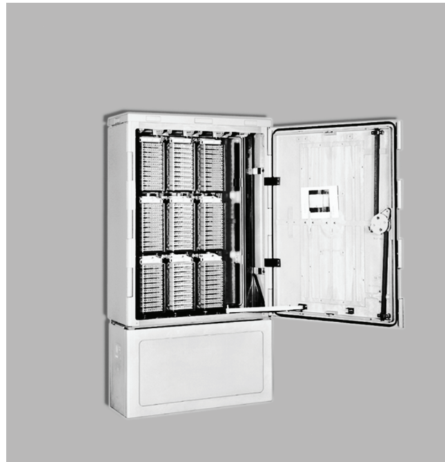
Cabinet 82A on plinth 1060. Example of a 3-vertical assembly (900 pairs) with cable heads 80