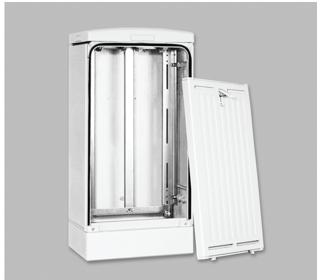
Cabinet 92AR with cable head rack, door version with half profile cylinder

Cabinet AR: A = without ventilation, R = jumper frame Cabinet AM: A = without ventilation, M = mounting plate Cabinet BM: B = with ventilation, M = mounting plate